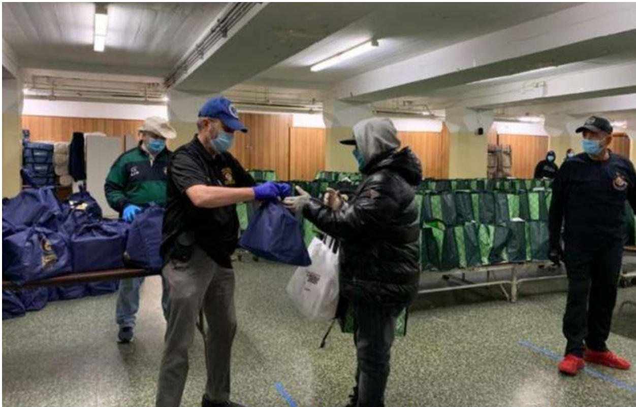
Catholic Charities distribute food at St. Michael – St. Malachy Parish, Brooklyn, NY. April 24, 2020

Knights/Catholic Charities distribute food to St. Michael-St. Malachy Parish, Brooklyn NY, April 24,2020